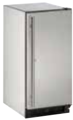
STAINLES SOLID (LOCK)