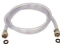
Part# BF JLA H538

Hose brushes loosen build-up in the line