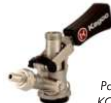
Part# KC KTS97D-W

Faucet wrenches give you the extra torque to remove tight faucets