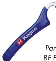
Part# BF FWHD

Beer Line Cleaning Jumper Hose allows you to clean two lines simultaneously