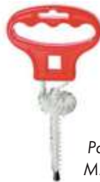
Part# MM 1900671

Acid line cleaner breaks down stubborn build-up