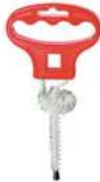
Coupler brushes help to clean deposits from your tap