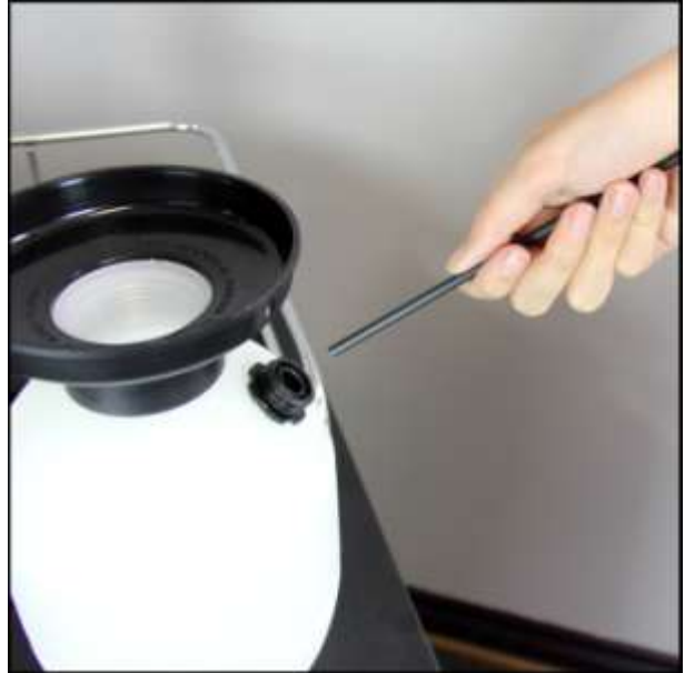
Insert Siphon Tube into Cleaning Bottle (1)