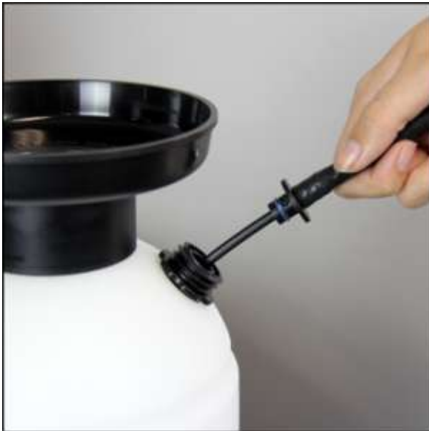
Push the Screw Cap down over the Plastic Hose Barb and screw it clockwise onto the Cleaning Bottle until tight.