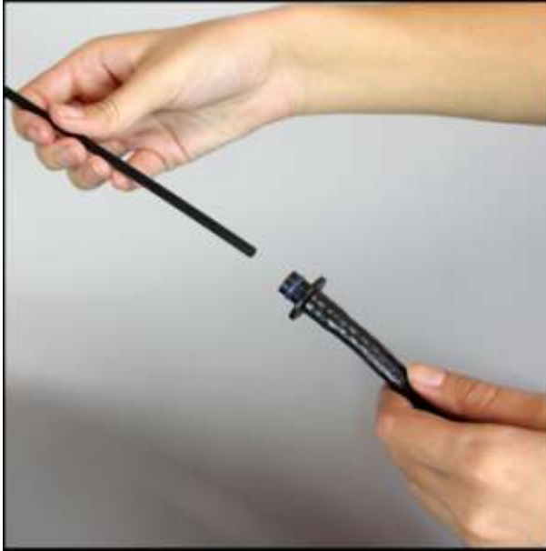
Insert the Siphon Tube (6) into the other end of the Plastic Hose Barb