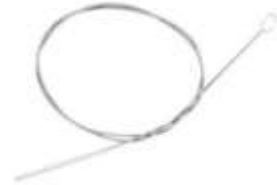
Hose brushes loosen build-up in the line