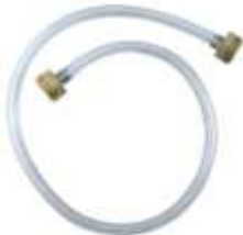
Beer Line Cleaning Jumper Hose allows you to clean two lines simultaneously