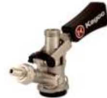
We have a wide variety of keg couplers for domestic and European kegs