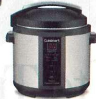
ELECTRIC PRESSURE COOKER: Holds six quarts—and won't blow its lid ($149; cuisinart.com )