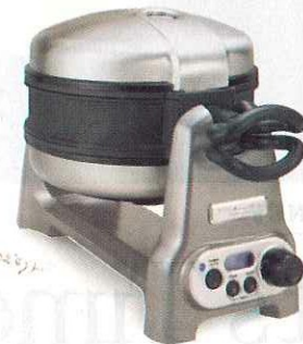
PRO LINE WAFFLE BAKER: For restaurant quality waffles ($199.95; kitchenaid.com )