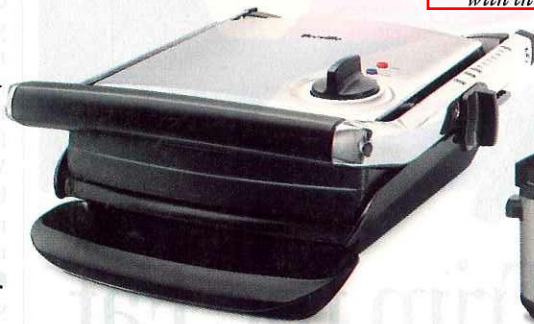
PANINI GRILL: Heats quickly and grills sandwiches perfectly ($99.99; brevilleusa.com )