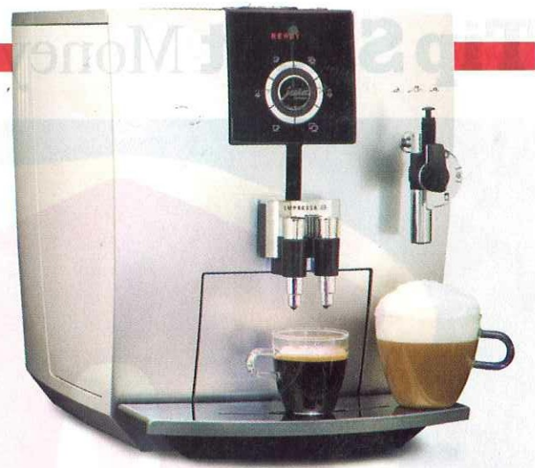
JURA CAPRESSO IMPRESSA J5: Make coffee or espresso with this high-tech 'coffee center' ($1,999; capresso.com )

Whether you love to cook or hate it, there's no denying that having the right appliance makes the process more enjoyable. In some cases, a well-made kitchen helper is a steal and, sometimes, you'll have to shell out a few clams to get the best performer. TIP SHEET tested many products in all price ranges and found a few favorites: