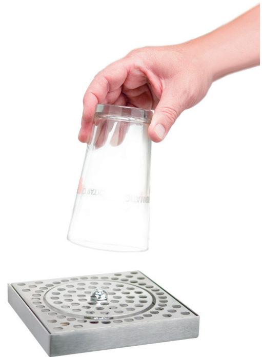
MM-5821 Stainless Steel