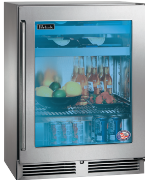
Glass Door Model