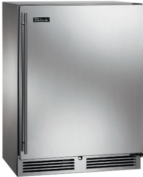
Solid Door Model

Perlick ® QUALITY & INNOVATION THAT INSPIRES