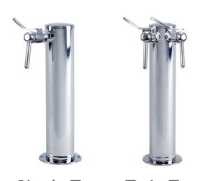
Single Tap Twin Tap