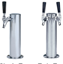
Single Tap Twin Tap