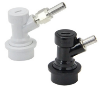
BALL LOCK COUPLERS