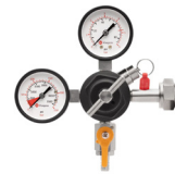
CO 2 REGULATOR